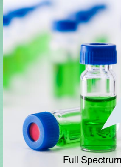
Full Spectrum Healthy Soil Microbiome

Industry Partner Western Sydney University